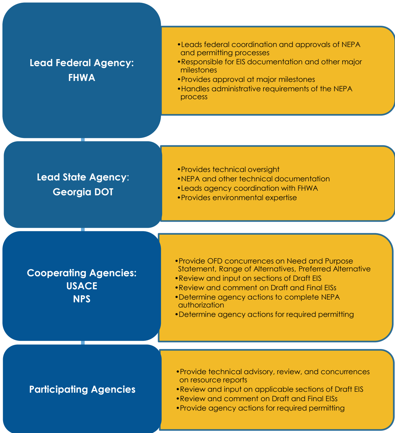
Exhibit 4-1: Project Roles and Responsibilities Chart