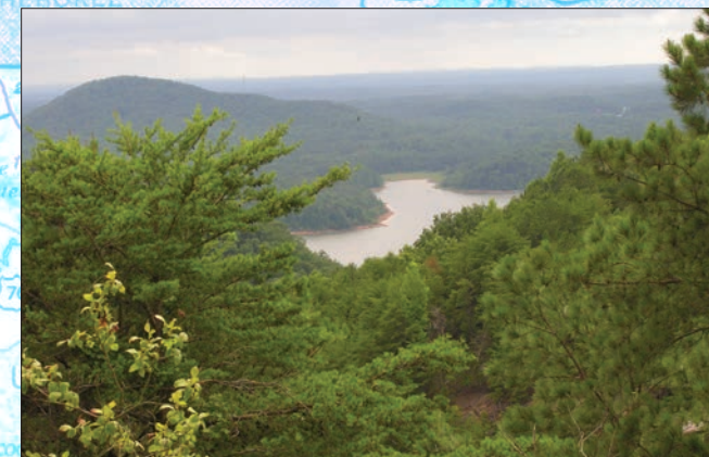
view of Carter's Lake