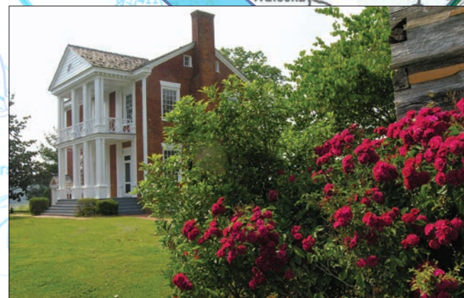
Chief Vann House