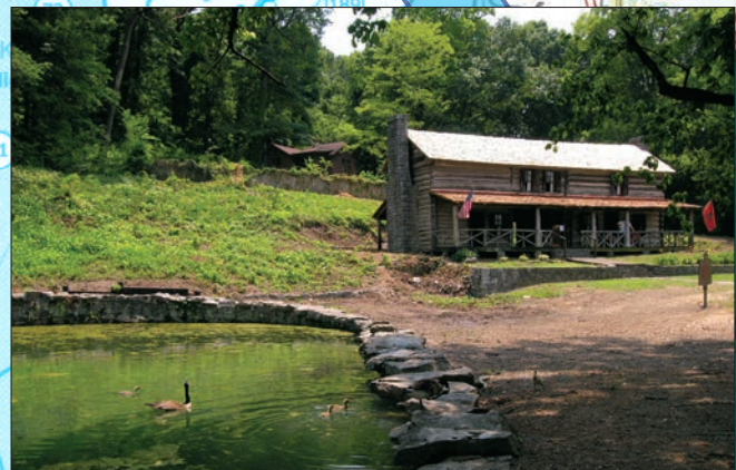
Chief John Ross House, Rossville