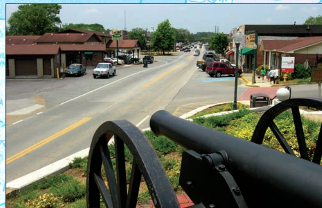
cannon in downtown, Ringgold