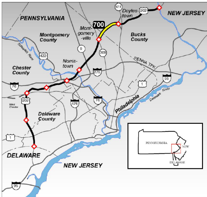
Figure 1 - US Rte. 202 Project Area