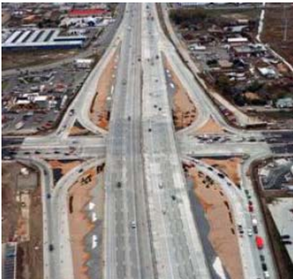
Figure 3 – Completed 12300 South Interchange with I-15

The Utah Department of Transportation identified economic development and addressed congestion reductions as primary goals in the 12300/12600 reconstruction. Route 71's interchange with I-15 often backed up and furthered congestion of I-15 itself. The at-grade rail intersection was less than a mile to the west and a passing train tended to exacerbate the I-15 congestion problem.