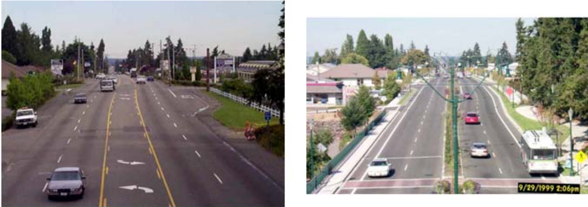
Figure 4 - Bridgeport Way Before (left image) and After (right image)

Source: National Research Council. (2004, July). Transportation Research Circular Number E-CC067: Context-Sensitive Design Around the Country, Some Examples. Washington, D.C: Transportation Research Board. Bridgeport Way.