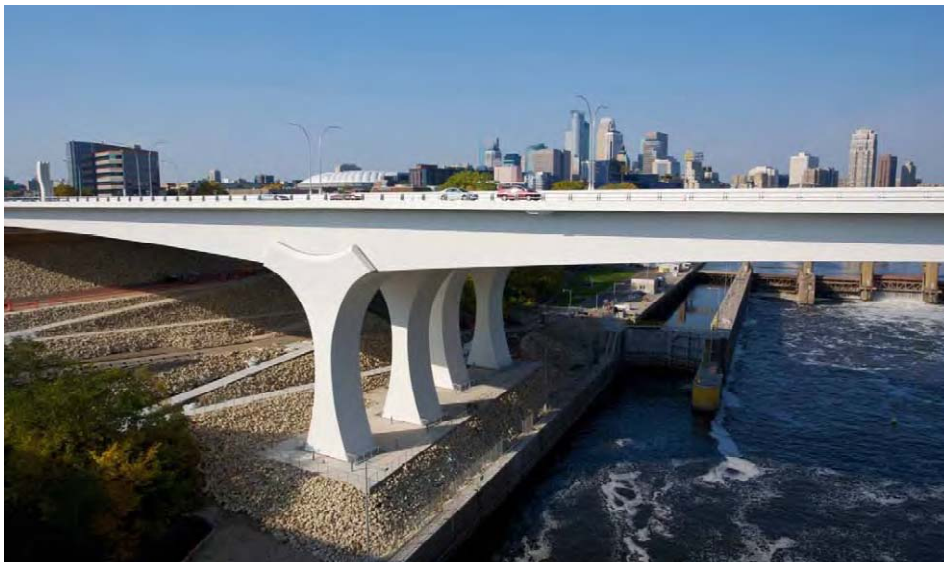
Figure 2 - St. Anthony Fall's Bridge (I-35) - Completed