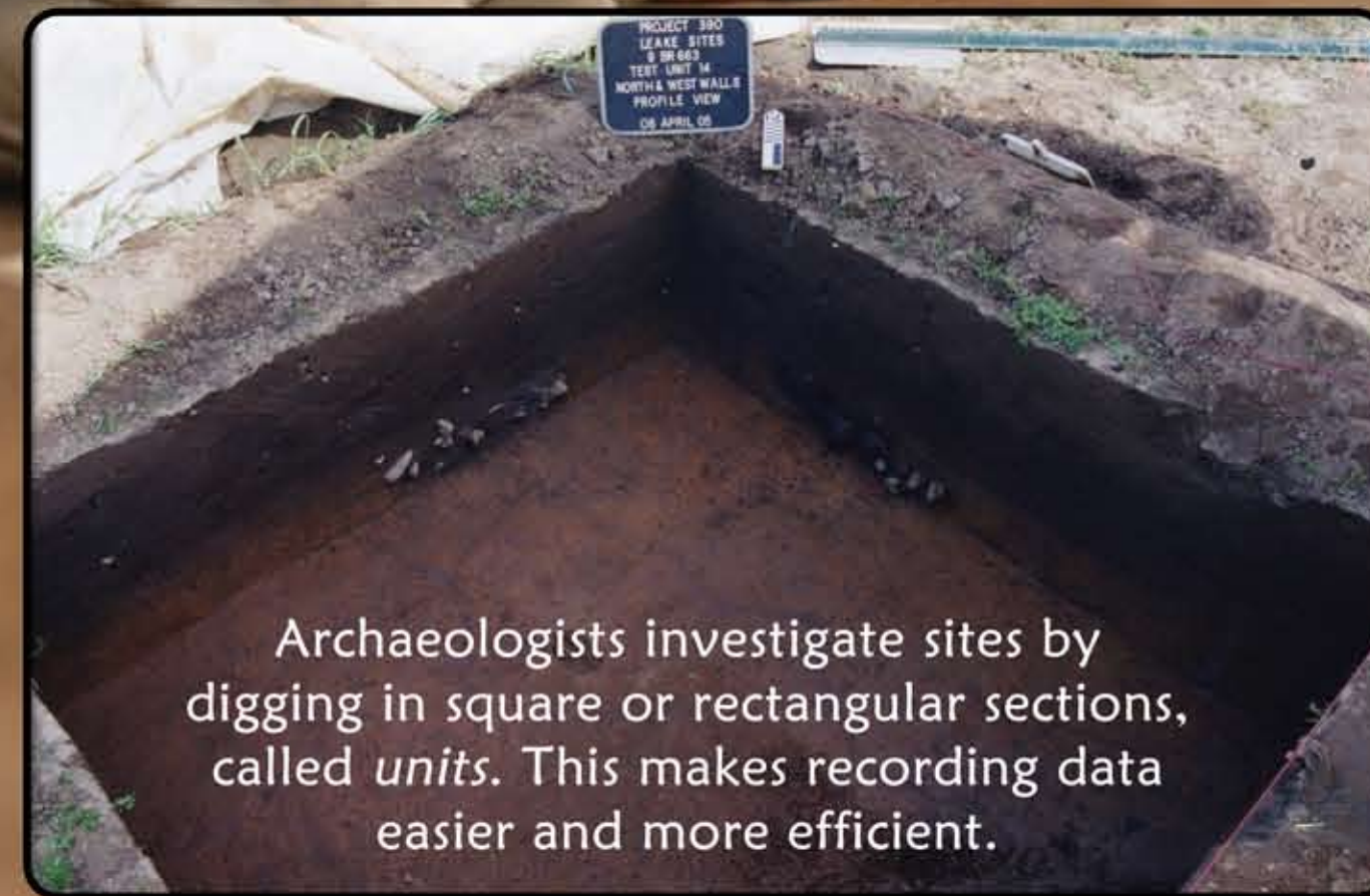
Archaeologists investigate sites by digging in square or rectangular sections, called units . This makes recording data easier and more efficient.

Excavated dirt is passed through wire mesh screens which catch small objects that might be missed otherwise. Here archaeologists are using water to soften the hard dirt.