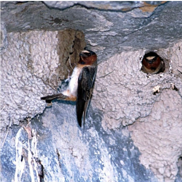
Cliff Swallows at nests.