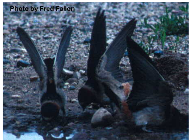
Cliff Swallows drinking from a puddle.

There are civil and criminal penalties for harming or killing this animal and its nest or eggs.