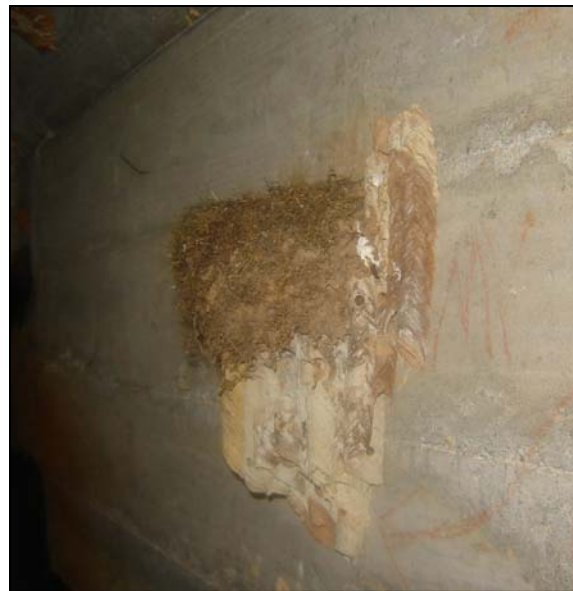
Eastern phoebe nest under a bridge

There are civil and criminal penalties for harming or killing this animal and its nest or eggs. See Special Provisions 107.23G