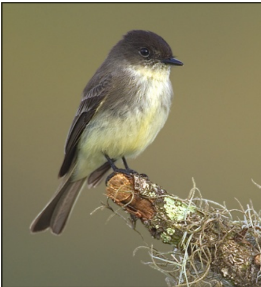
Adult Eastern phoebe