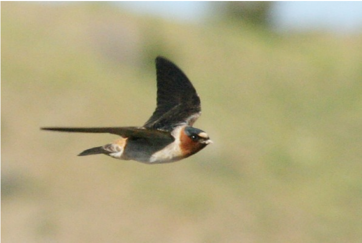
Cliff Swallow in flight.