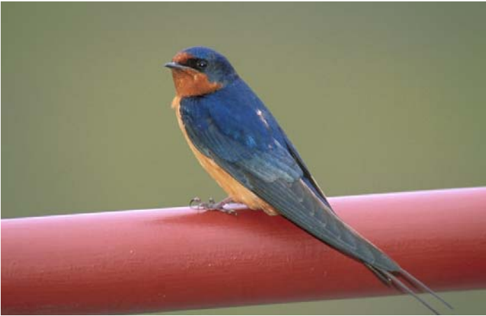
Adult Barn Swallow