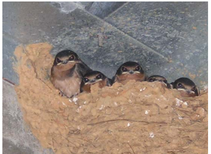
Immature Barn Swallows in nest.

There are civil and criminal penalties for harming, killing this animal and its nest or eggs.