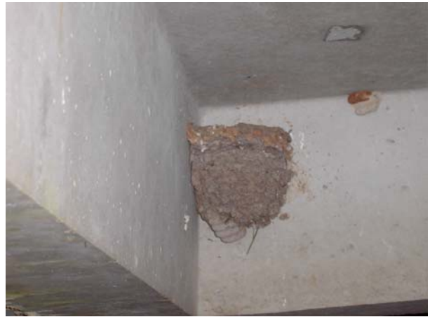
Barn Swallow nest under a bridge.