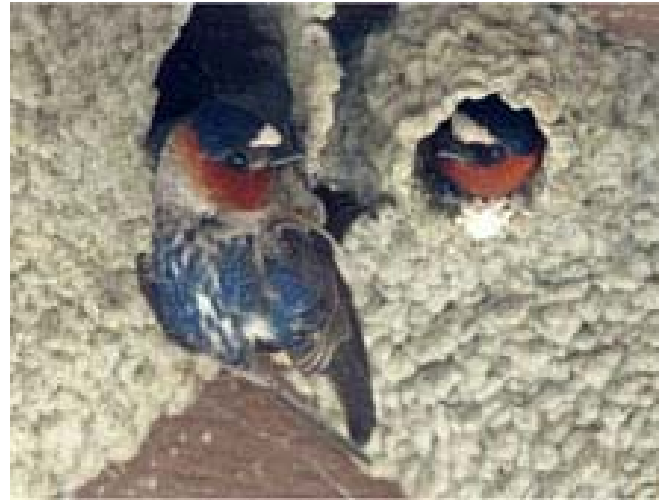
Cliff Swallows at nests.