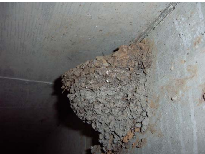
Barn Swallow nest under a bridge.