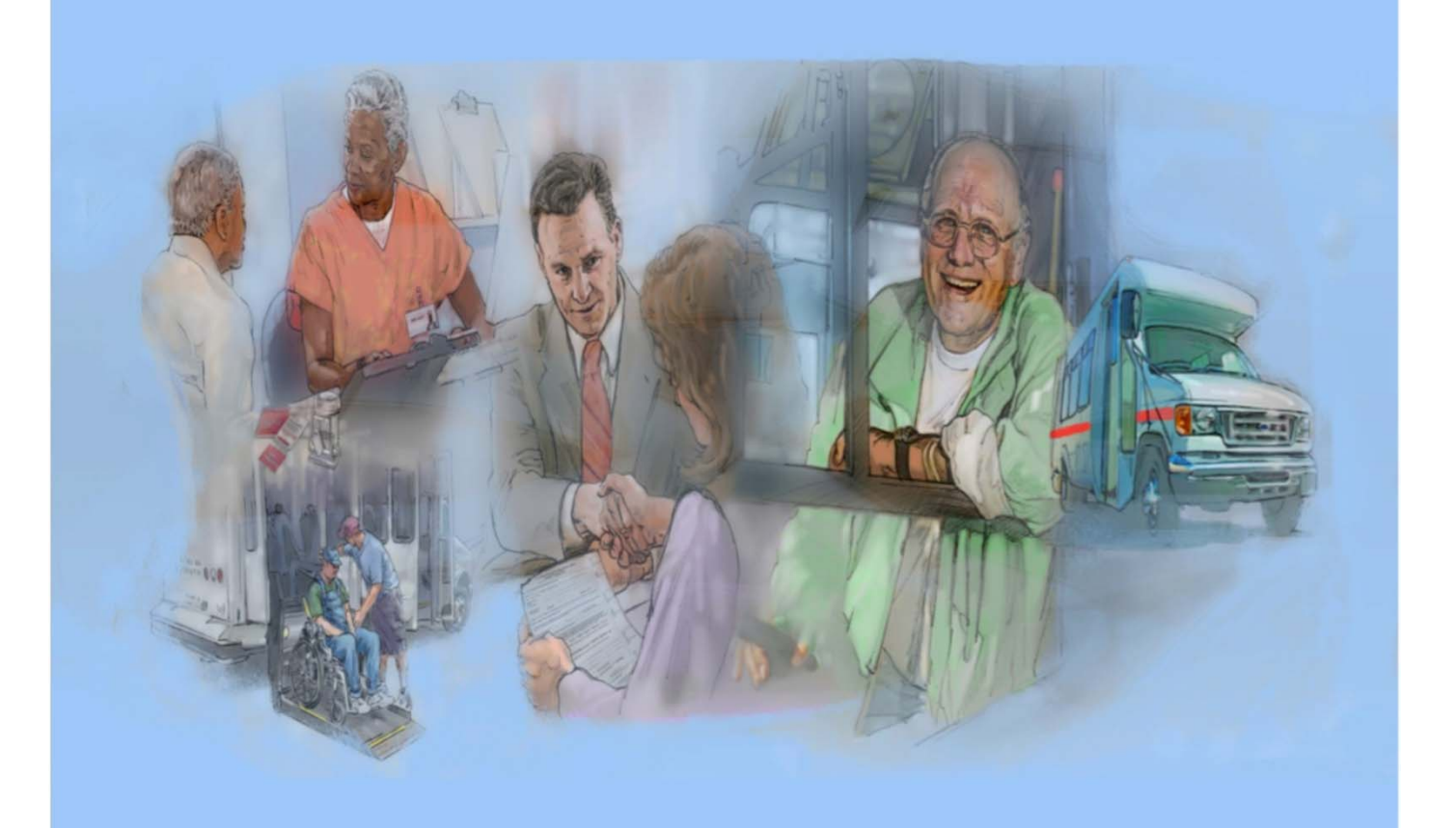
DRUG AND ALCOHOL PROGRAM MANAGERS (DAPMS) AND DESIGNATED EMPLOYER REPRESENTATIVES (DERS)