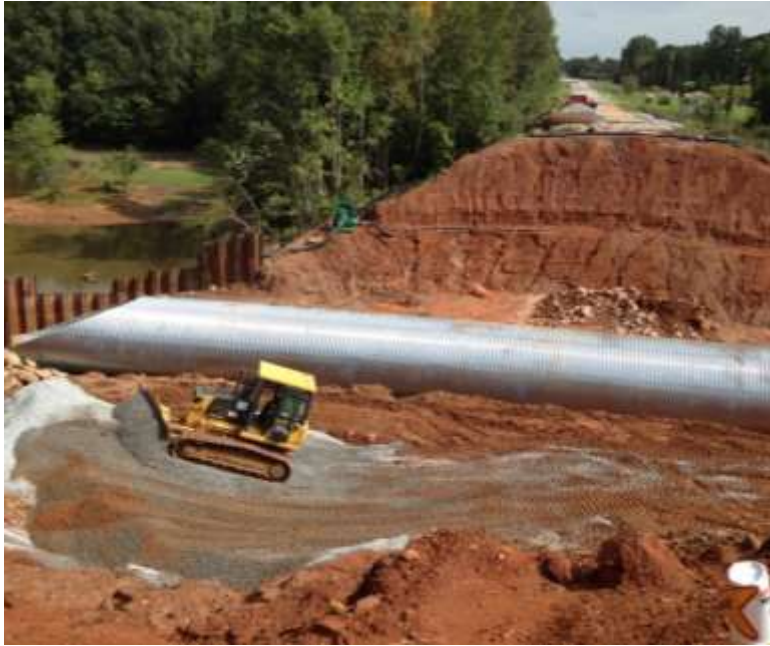
Highway 51 sinkhole at Lake Hartwell – Emergency Repair Project of the Year