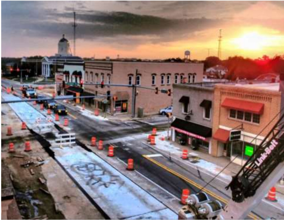
Highway 11/Broad Street Technical Innovation Project of the Year