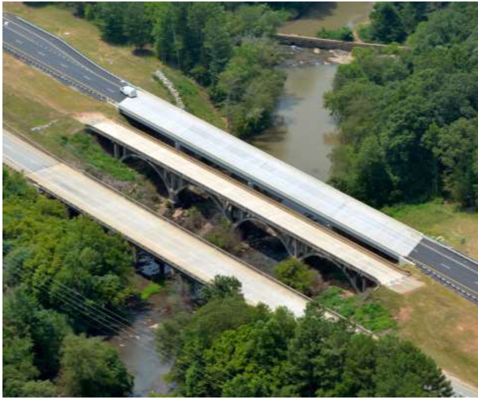
SR 10/US 78 Historic Preservation Project of the Year – 1938 WPA built bridge is in center