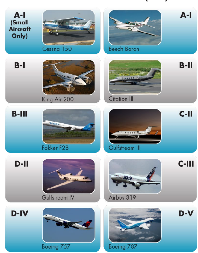
FIGURE 2-1: RDC AIRCRAFT TYPES AIRPORT REFERENCE CODE (ARC)

Generally speaking, aircraft in Approach Category A and Design Group I are small general aviation aircraft. Most general aviation aircraft seldom exceed Approach Category C. Aircraft above Approach Category C are typically commercial aircraft, but even some smaller commercial planes are included in Approach Category C. The higher the letter designation for the Approach Category and the higher the Roman Numeral for the Design Group, the larger the aircraft that the airport is designated to accommodate, as shown in Figure 2-1 .