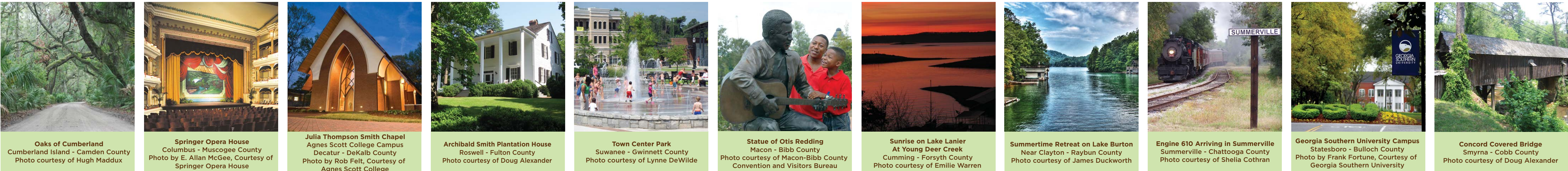
Oaks of Cumberland - Cumberland Island - Camden County Springer Opera House - Columbus - Muscogee County Julia Thompson Smith Chapel - Agnes Scott College Campus - DeKalb County Archibald Smith Plantation House - Roswell - Fulton County Town Center Park - Suwanee - Gwinnett County Statue of Otis Redding - Macon - Bibb County Sunrise on Lake Lanier - At Young Deer Creek - Cumming - Forsyth County Summertime Retreat on Lake Burton - Near Clayton - Rayburn County Engine 610 Arriving in Summerville - Summerville - Chattooga County Georgia Southern University Campus - Statesboro - Bulloch County Concord Covered Bridge - Smyrna - Cobb County