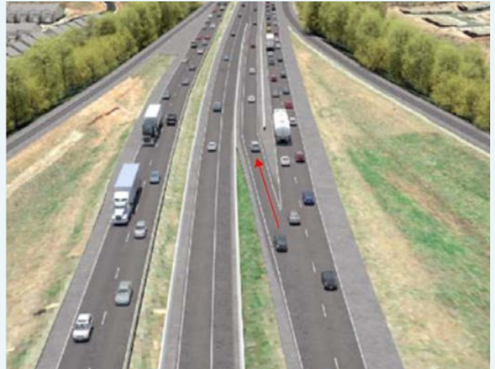
Depiction of slip ramp: Southbound traffic from general purpose lanes 'slipping' into express lanes in the median

general purpose lanes instead of entering or exiting through interchanges. These slip ramps will be located along I-575 at Barrett Parkway, Big Shanty Road, Shallowford Road and Sixes Road.