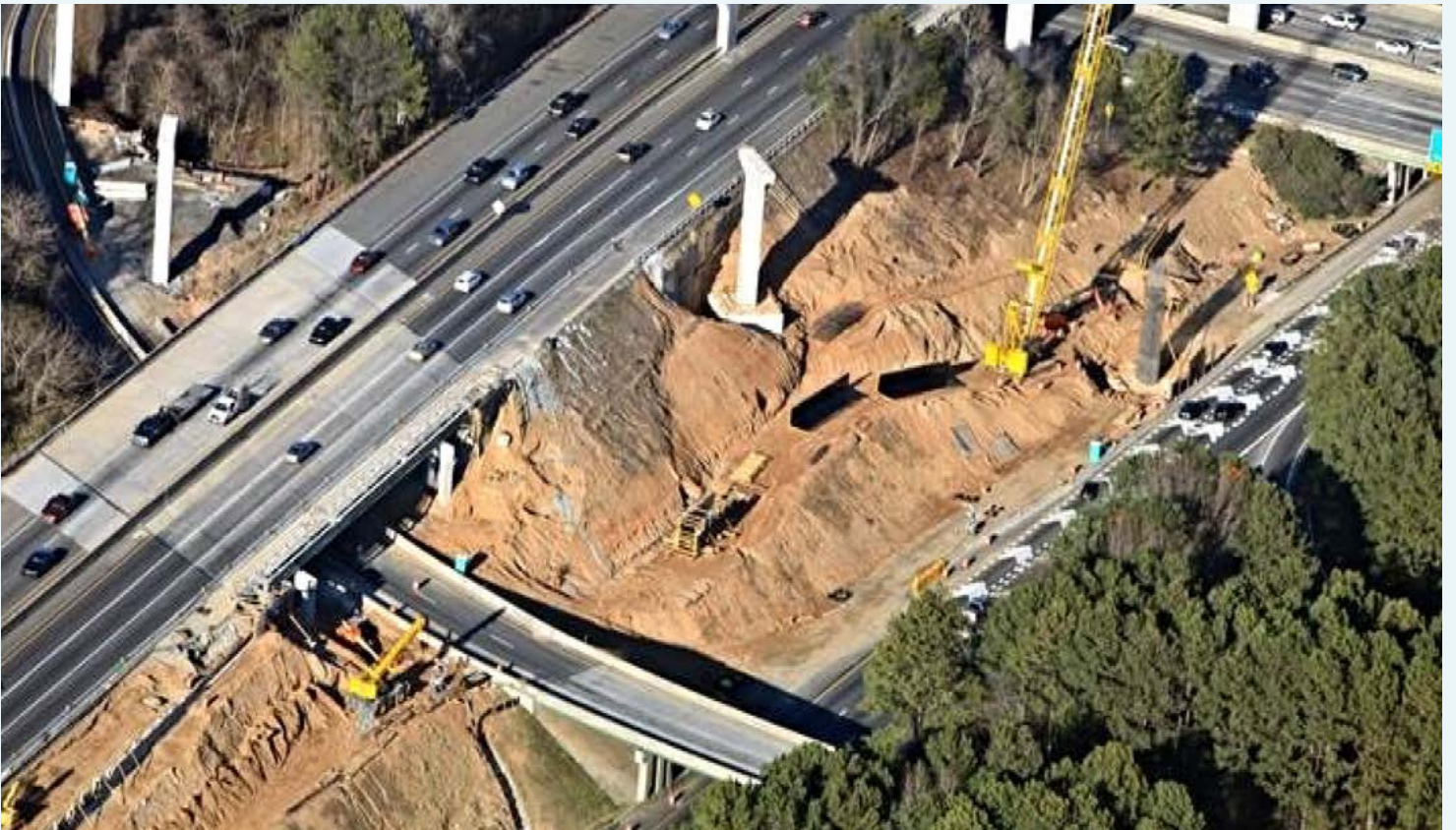
Aerial view of construction at the I-75/I-285 Interchange