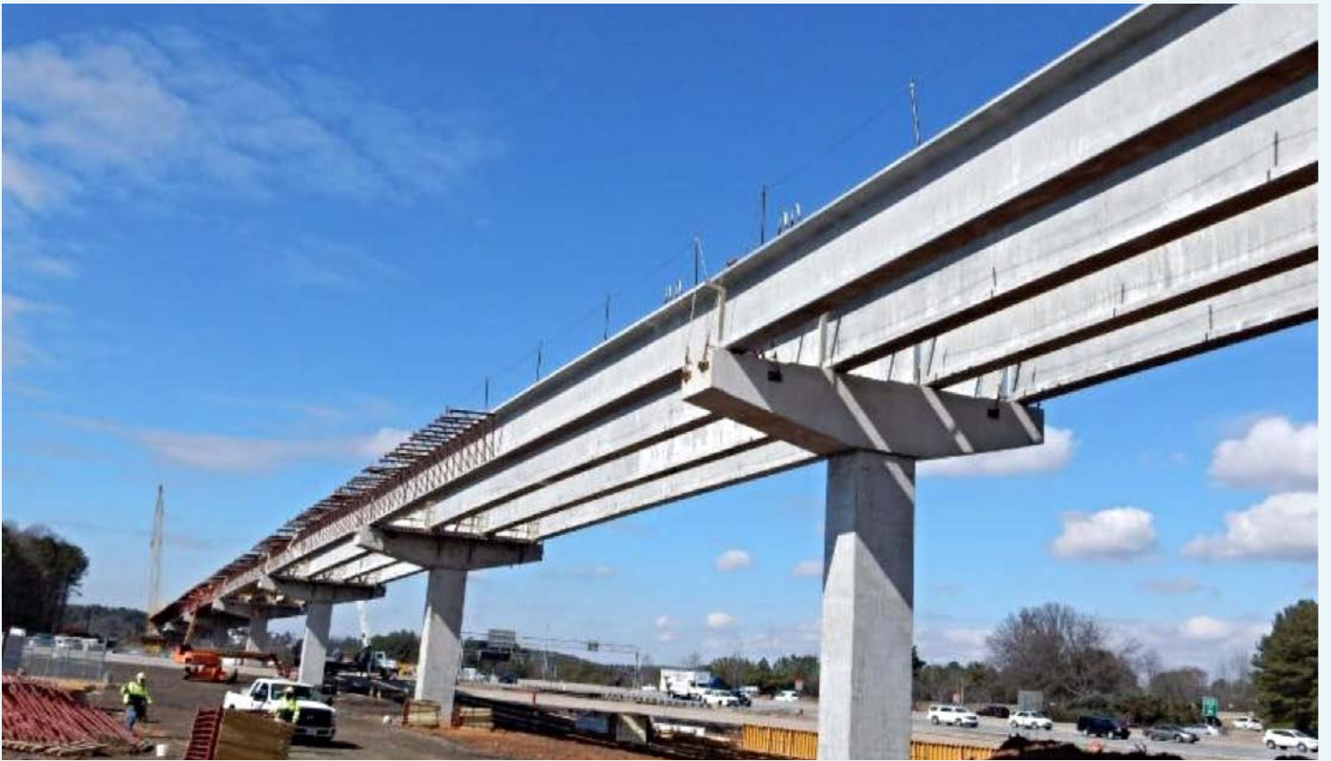
Setting beams on a mile-long bridge at I-75 and Canton Road